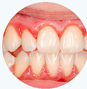
Gum disease (gingivitis), which causes your gums to be red, puffy, and tender