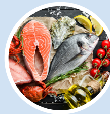
Fish (fresh or canned), crab, and shrimp