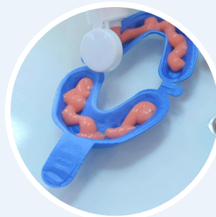
Gel or foam applied in trays (moderately effective)