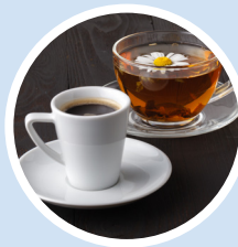
Brewed black tea and coffee