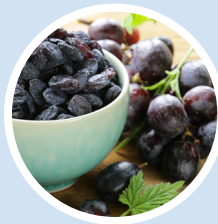
Grapes and raisins