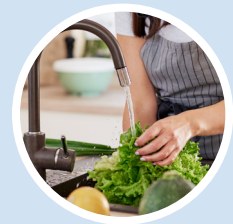
Food prepared in or with fluoridated water