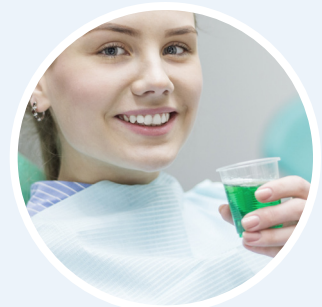
Mouth rinse (least effective)